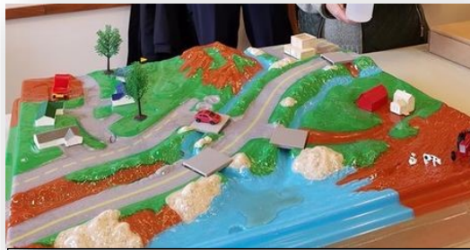
Model used by LWVLMR to demonstrate how watersheds work.

Four individual grants (one for each lake – Lake Winnebago, Lake Poygan, Lake Butte des Morts and Lake Winneconne - were awarded to finalize